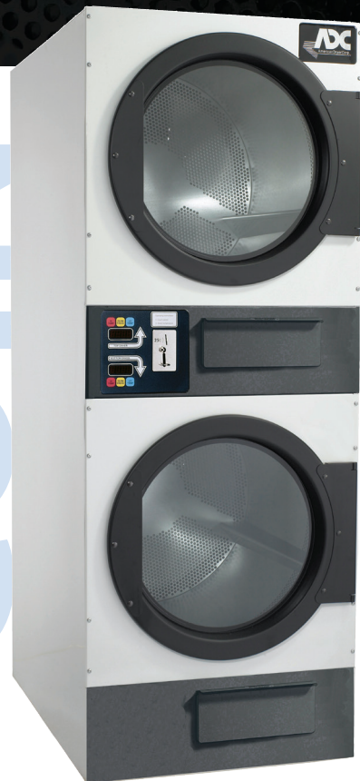
AD-333 Coin Stack Dryer