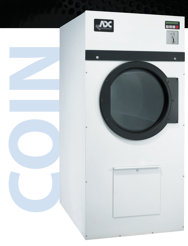
AD-30V Coin Dryer