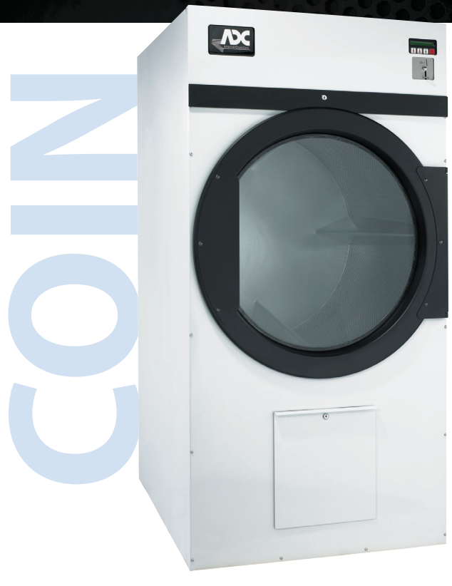
AD-115 Coin Dryer